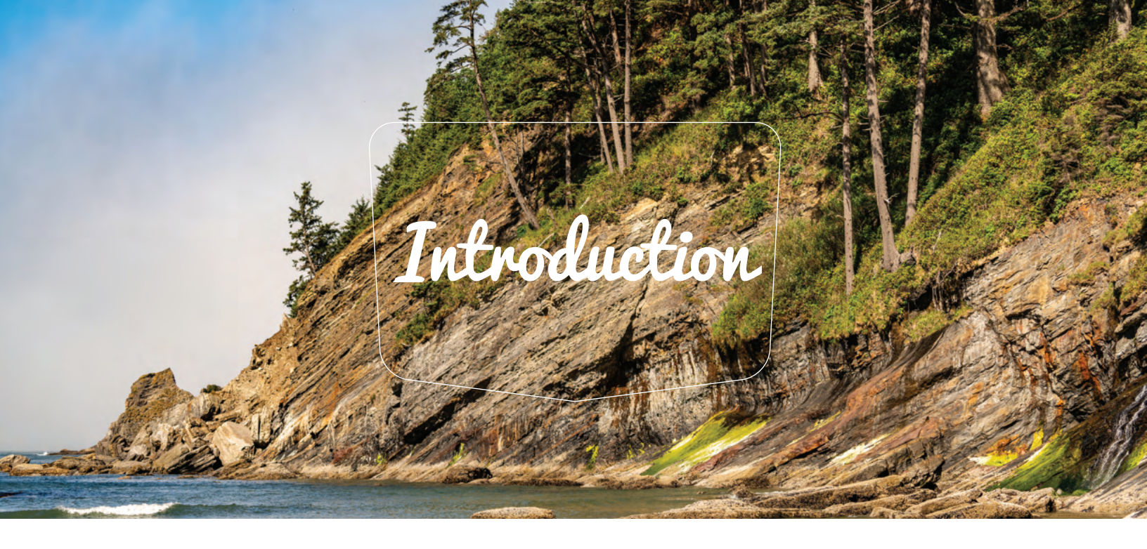
The Oregon Coast Trail, as a walking path navigable across the entire Oregon Coast, is not a new idea. Indigenous peoples forged most of the path over many centuries. For many decades Oregonians have envisioned a continuous trail which would serve the communities along the trail while delighting visitors and hikers.

In 2017, after dedicated advocacy from Oregonians, the Oregon Legislature approved legislation (HB 3149) to start the formal planning process for connecting and improving the trail. A needs assessment which consulted over 100 leaders in several key segments of the Trail was conducted by the Association of Oregon Counties in 2017.